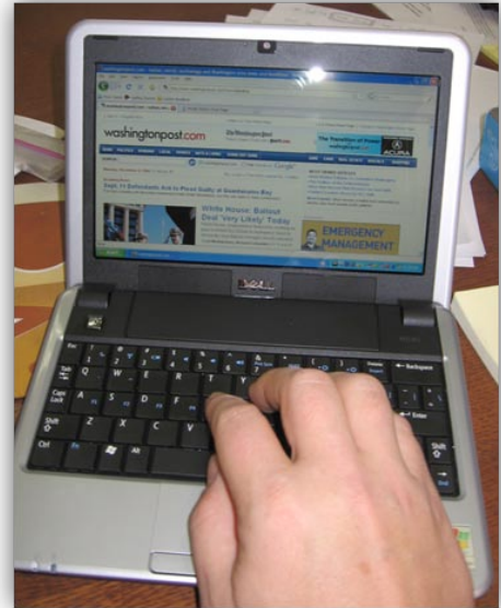
Reading the Washington Post on the Dell Mini Netbook

At the Georgetown Law Library, we needed to replace an obsolete laptop used for class and conference presentations, but we did not want a bulky or expensive laptop. After considering a few netbook models, we chose the Dell Mini running Windows XP. We have had good experience with Dell technical support, and this seemed like a good match. It is interesting that Dell did not offer a three-year warranty for the Mini.